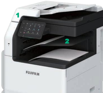
2. Exit 2 Tray

2 ways output tray Allows to separate the print output each copy, fax and print job