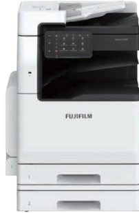
With 1 Tray Module

Standard Tray • 520 sheets capacity tray x 1-tray