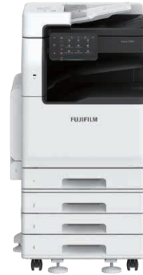
With 3 Tray Module

With 1 Tray Module • 520 sheets capacity tray x 2-tray