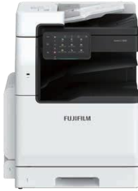
Standard Configuration 1 Tray

Standard Tray • 520 sheets capacity tray x 1-tray