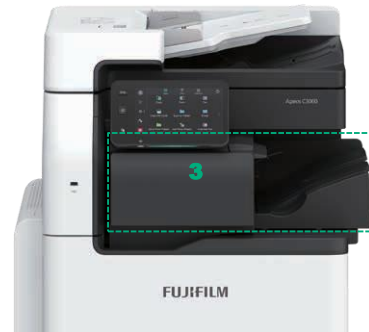
3. Finisher-A2 • Single stapling, Dual stapling